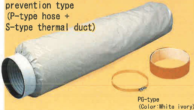
PG-type (Color: White ivory)

Superior insulating dew condensation prevention type (P-type hose + S-type thermal duct)