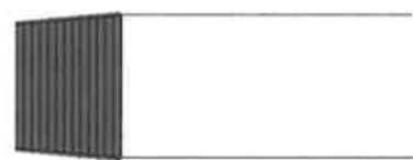
Cover complete threaded portion