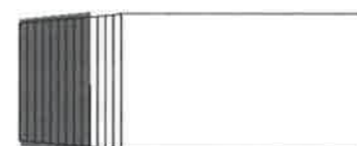
Apply to 2/3 width of threaded portion